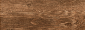
WOODLANDS II | EFCW2002 SEQUOIA