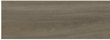
WOODLANDS II | EFCW2012 HAZEL