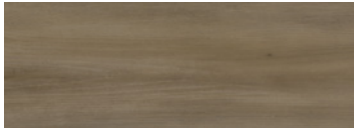
WOODLANDS II | EFCW2013 TAMARACK