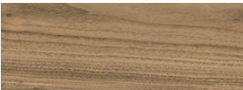
WOODLANDS II | EFCW2007 DANISH TEAK