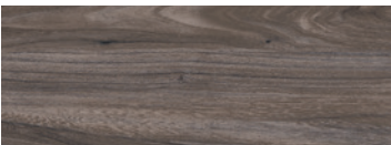
WOODLANDS II | EFCW2001 IRONWOOD