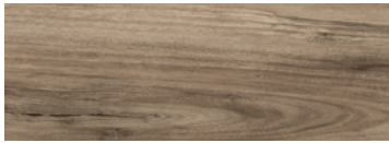
WOODLANDS II | EFCW2008 ACACIA