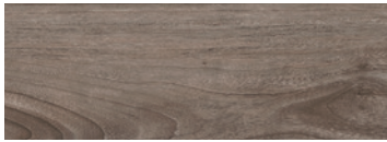
WOODLANDS II | EFCW2010 MOCHA