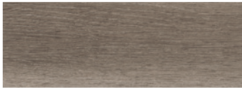
WOODLANDS II | EFCW2009 SILVER ASH