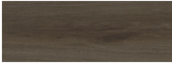
WOODLANDS II | EFCW2011 TAWNY ASH