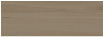
WOODLANDS II | EFCW2014 HONEY MAPLE