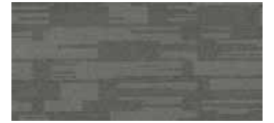
TME55 | PYTHIAD SILVER