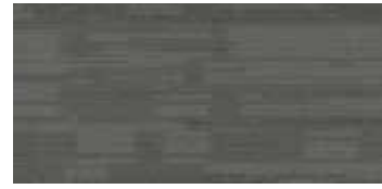
TME56 | INTERLAPSE GREY