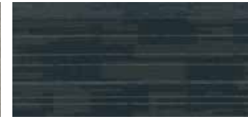
TME48 | COSMIC BLUE