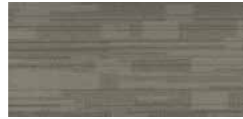
TME32 | SOLAR LINEN