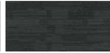
TME59 | JET LAG