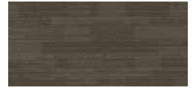
TME78 | STANDARD TAN