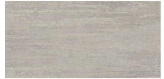
EFCP2 001 | ACIER (AVAILABLE IN EFCP5 001)