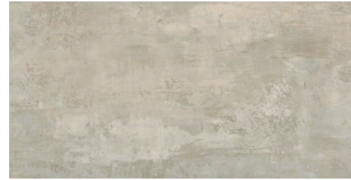
EFCSC 00001 | WHITEWASH (AVAILABLE IN EFCSS 00001)