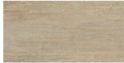
EFCP2 003 | UMBRA (AVAILABLE IN EFCP5 003)