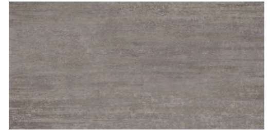
EFCP2 004 | ZINC (AVAILABLE IN EFCP5 004)