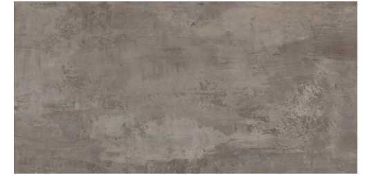
EFCSC 00002 | LIMESTONE (AVAILABLE IN EFCSS 00002)