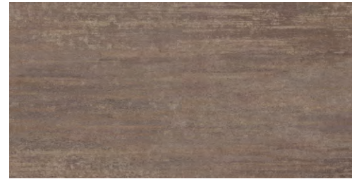
EFCP2 005 | EARTH (AVAILABLE IN EFCP5 005)