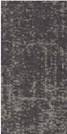
DIV15 GADGETS QUICKSHIP