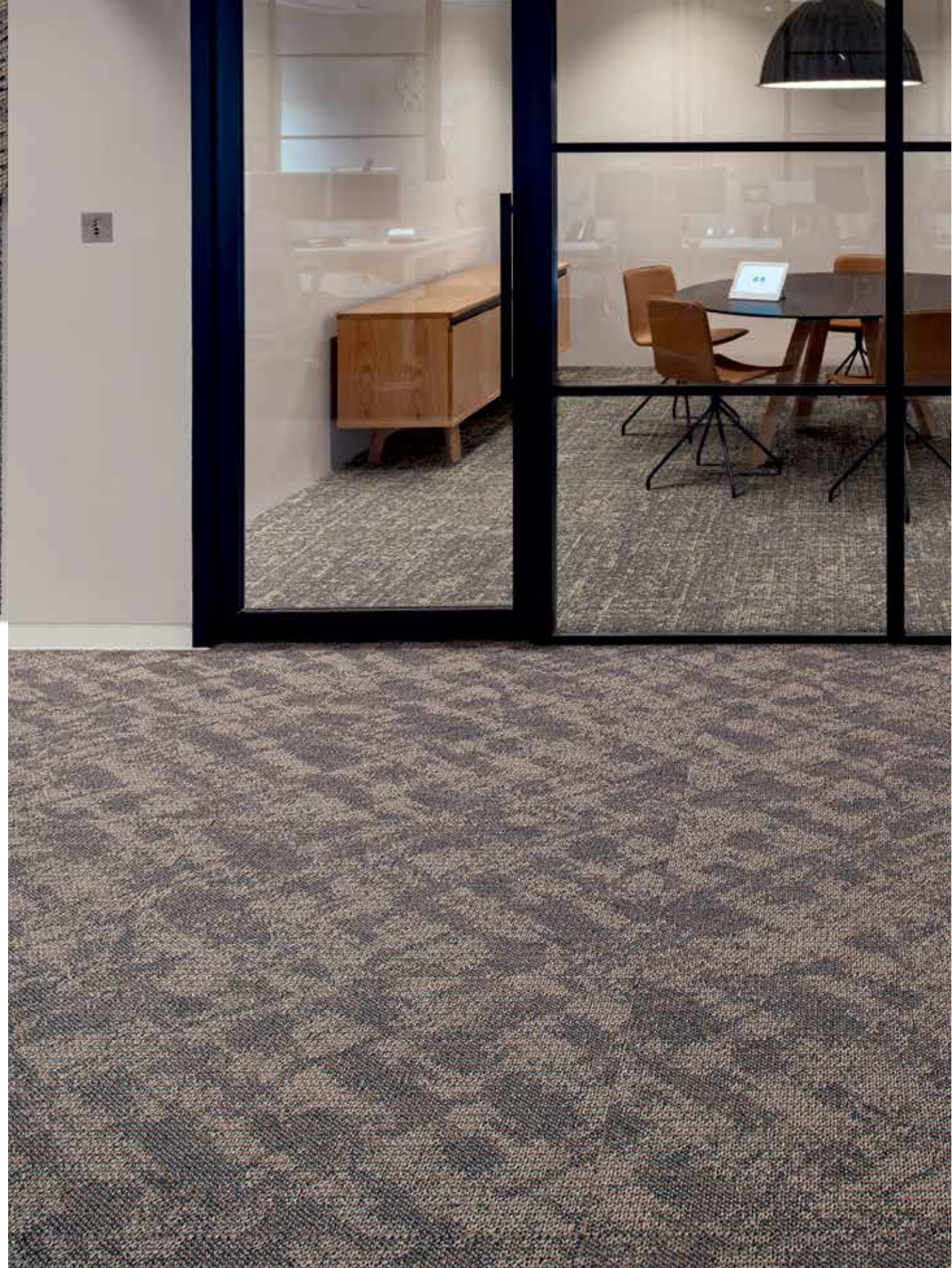
DIVERSITY - MILLENNIALS - MONOLITHIC | TECH SAVVY - MILLENNIALS - MONOLITHIC