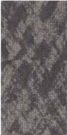
TSY15 GADGETS QUICKSHIP