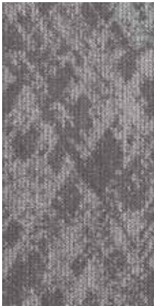
TSY54 ZOOMERS QUICKSHIP