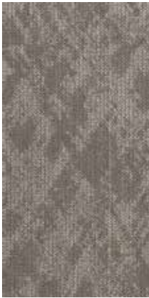
TSY12 SOCIAL QUICKSHIP