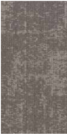
DIV12 SOCIAL QUICKSHIP