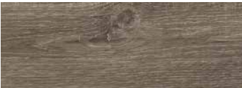
WOODLANDS | EFCWL004 BRIARWOOD