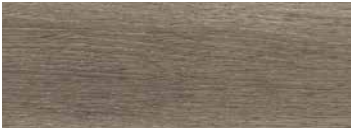
WOODLANDS | EFCWL009 SILVER ASH