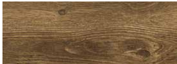
WOODLANDS | EFCWL002 SEQUOIA