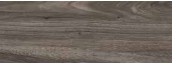
WOODLANDS | EFCWL001 IRONWOOD