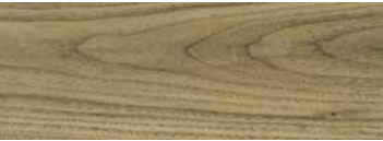
WOODLANDS | EFCWL007 DANISH TEAK