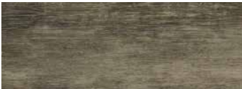
WOODLANDS | EFCWL003 OAKWOOD