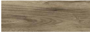
WOODLANDS | EFCWL008 ACACIA