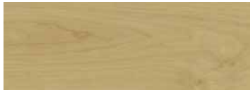
WOODLANDS | EFCWL005 NORTHERN BIRCH