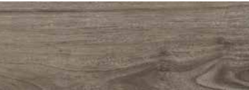
WOODLANDS | EFCWL010 MOCHA