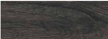
WOODLANDS | EFCWL006 EBONY