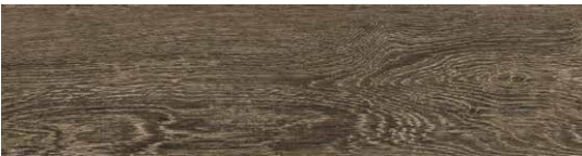
EFCPB 005 | FOSSIL