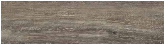
EFCPB 008 | SUEDE GRAY