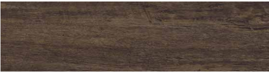
EFCPB 007 | COCOA