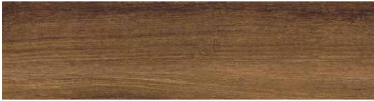
EFCPB 004 | AUTUMN LEAF