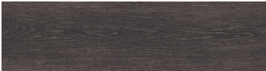
EFCPB 010 | SHADOW