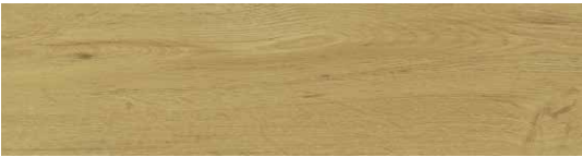
EFCPB 001 | STRAW