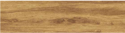
EFCPB 003 | SUNGLOW