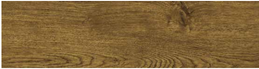
EFCPB 002 | TWIG