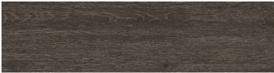
EFCPB 006 | BARKTONE