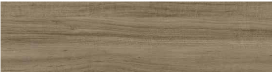
EFCPB 009 | CLOUD