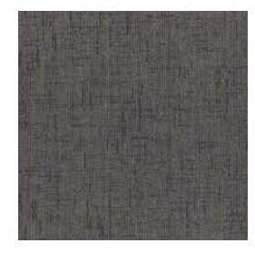
CWK46 | COBALT