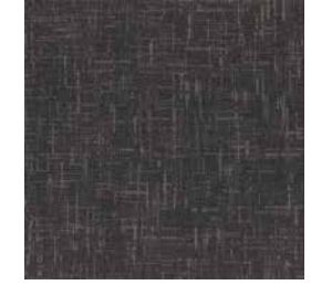
CWK57 | SLATE QUICKSHIP