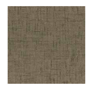
CWK75 | ACORN