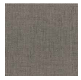
CWK43 | LARK