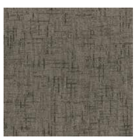
CWK15 | DAPPLE GREY QUICKSHIP