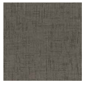
CWK55 | LEAD QUICKSHIP