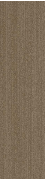
CMT14 GOLDEN INTUITION