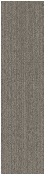
CMT75 MINK ESSENCE