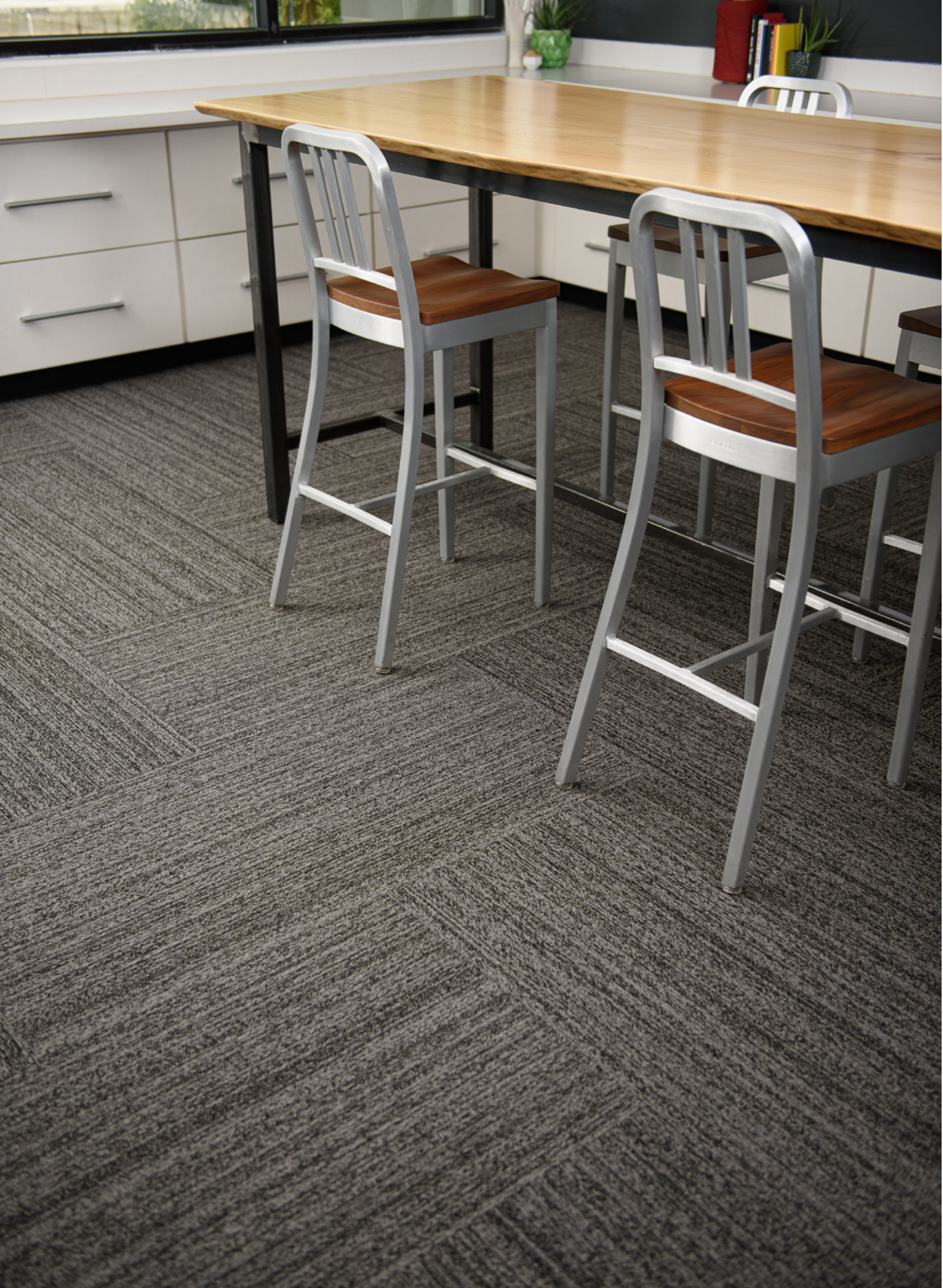
COMMON THREAD - OBSIDIAN MELD - DOUBLE HERRINGBONE

Scan to order samples or check inventory.