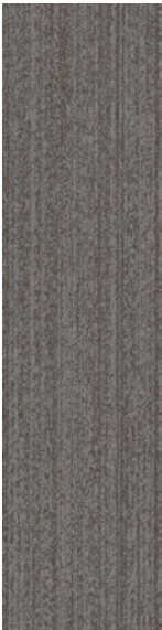
CMT56 PLATINUM BLEND