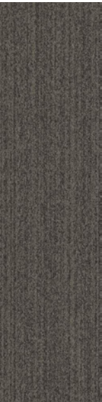
CMT58 GRAPHITE LINK