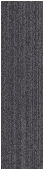
CMT49 INDIGO SPIRIT