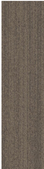
CMT76 BARK INTEGRATE