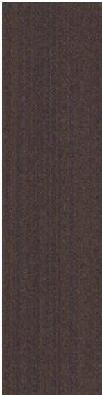
CMT98 PLUM CONCORD