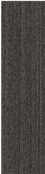
CMT77 OBSIDIAN MELD