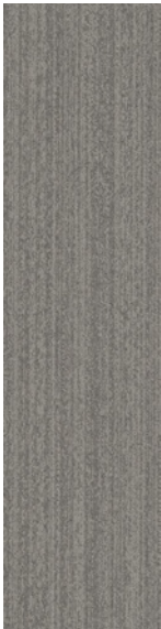
CMT51 PEWTER RAPPORT