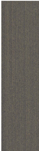
CMT47 SAGE AFFINITY