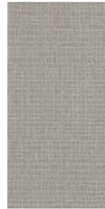
BTM72 | BEIGE