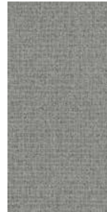
BTM52 | ARGENTE QUICKSHIP