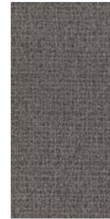
BTM78 | MARRON QUICKSHIP