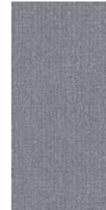
BTM54 | ACIER