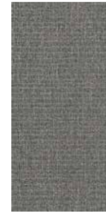
BTM35 | BRONZE