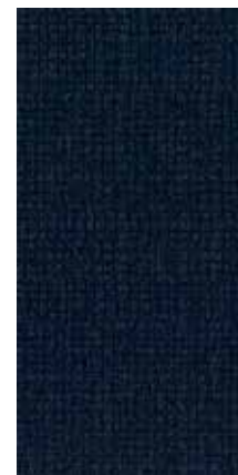
BTM49 | BLEU MARINE