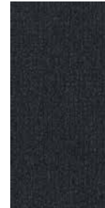
BTM58 | NOIR QUICKSHIP