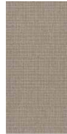
BTM24 | PECHE