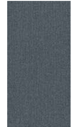
BTM45 | BLEU