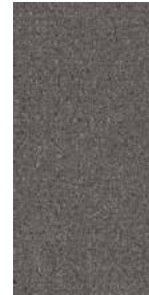
BTM56 | GRIS QUICKSHIP