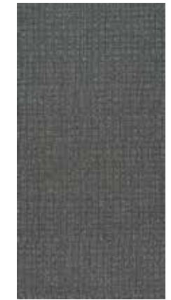
BTM37 | VERT