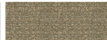
BATISTE II | TBTT14 | BTT14 EURO FLAX