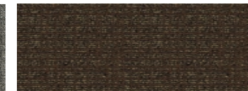
BATISTE II | TBTT78 | BTT78 FISHNET