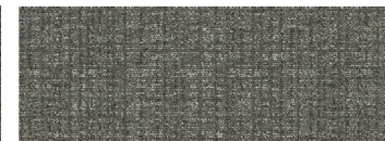
BATISTE II | TBTT74 | BTT74 FEDORA