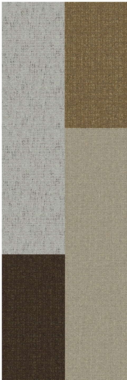
BATISTE II - SATEEN / BATISTE II - WORSTED / BATISTE II - FISHNET / BATISTE II - ANTIQUE LACE