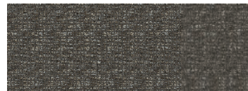
BATISTE II | TBTT58 | BTT58 TWEED DELUXE