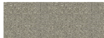
BATISTE II | TBTT51 | BTT51 SILK & SEQUINS