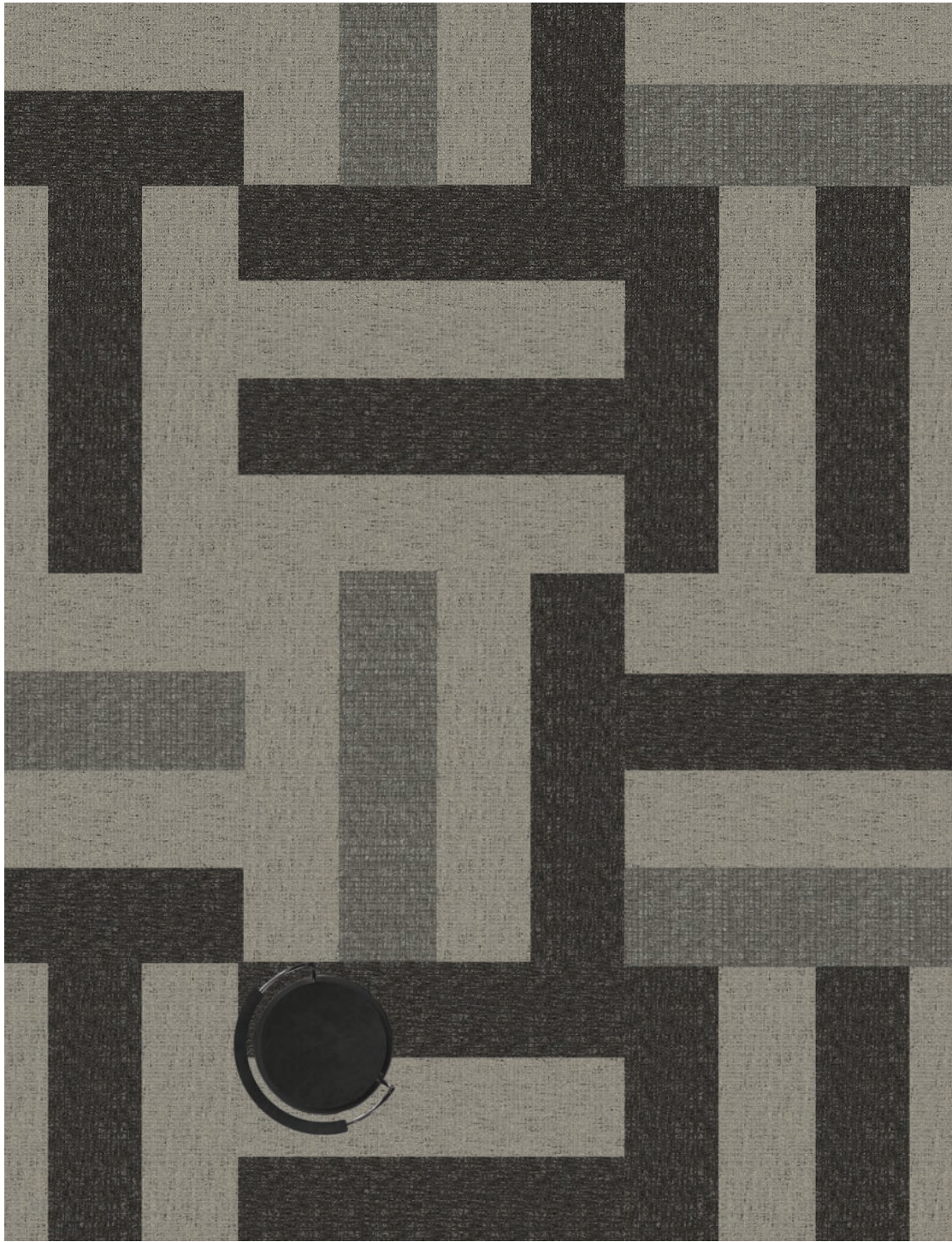
BATISTE II - FEDORA / BATISTE II - SATEEN / BATISTE II - TWEED DELUXE