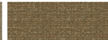
BATISTE II | TBTT24 | BTT24 WORSTED