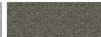
BATISTE II | TBTT56 | BTT56 GROSGRAIN