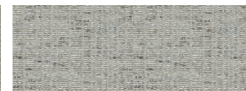
BATISTE II | TBTT53 | BTT53 SATEEN