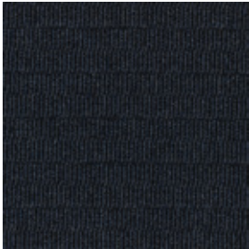
ARV44 BLUE MOON