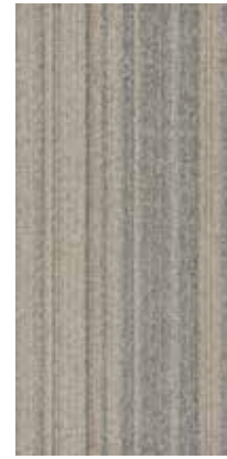
ALL11 | SAND