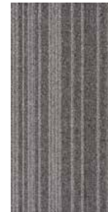
ALL56 | VERDANT