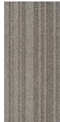
ALL53 | FAWN