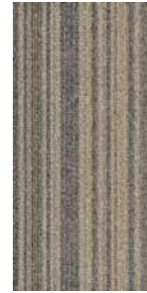
ALL14 | SAFFRON