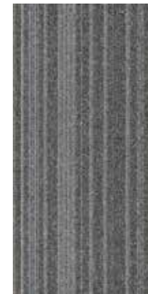
ALL54 | ANILINE