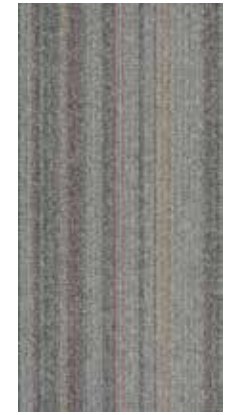
ALL52 | MANDARIN