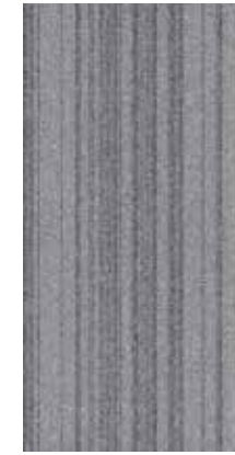
ALL51 | GREY TONE