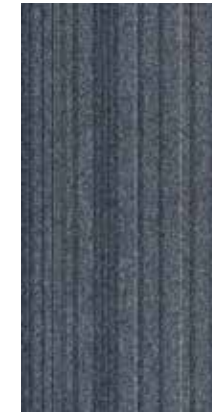
ALL45 | DENIM