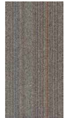
ALL76 | TAUPE