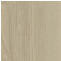
001 Pacific Crest