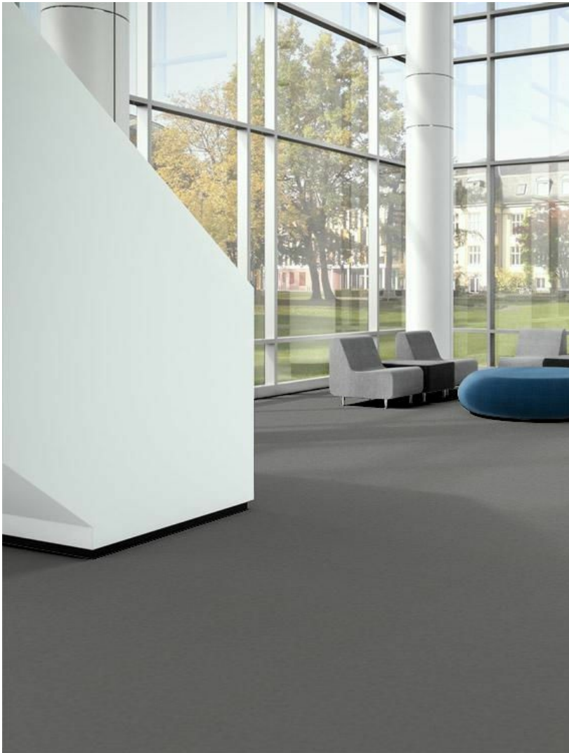
Installation Methods: Parquet, Herringbone, Basketweave, Ashlar