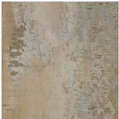
001 Cafe Au Lait