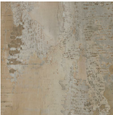
001 Cafe Au Lait