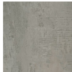
005 Foggy Beach