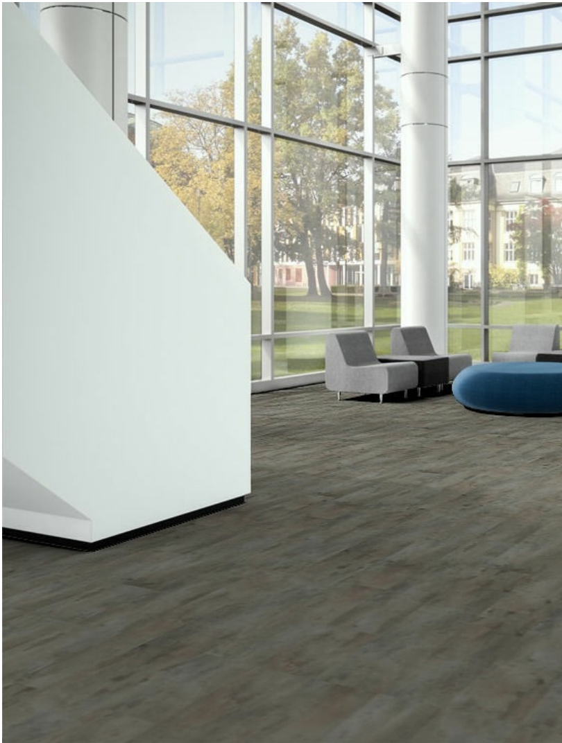
Installation Methods: Ashlar, Herringbone, 1/3 Drop