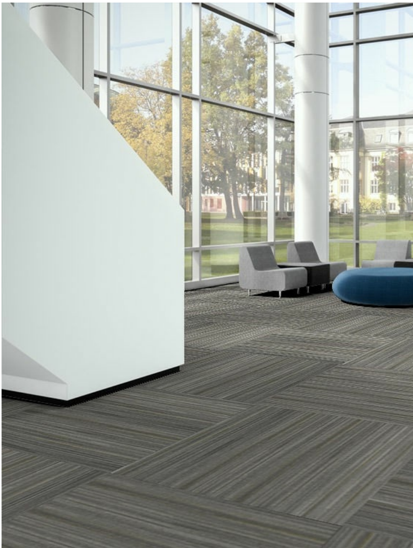
Installation Methods: Ashlar, Basketweave, Herringbone, Parquet