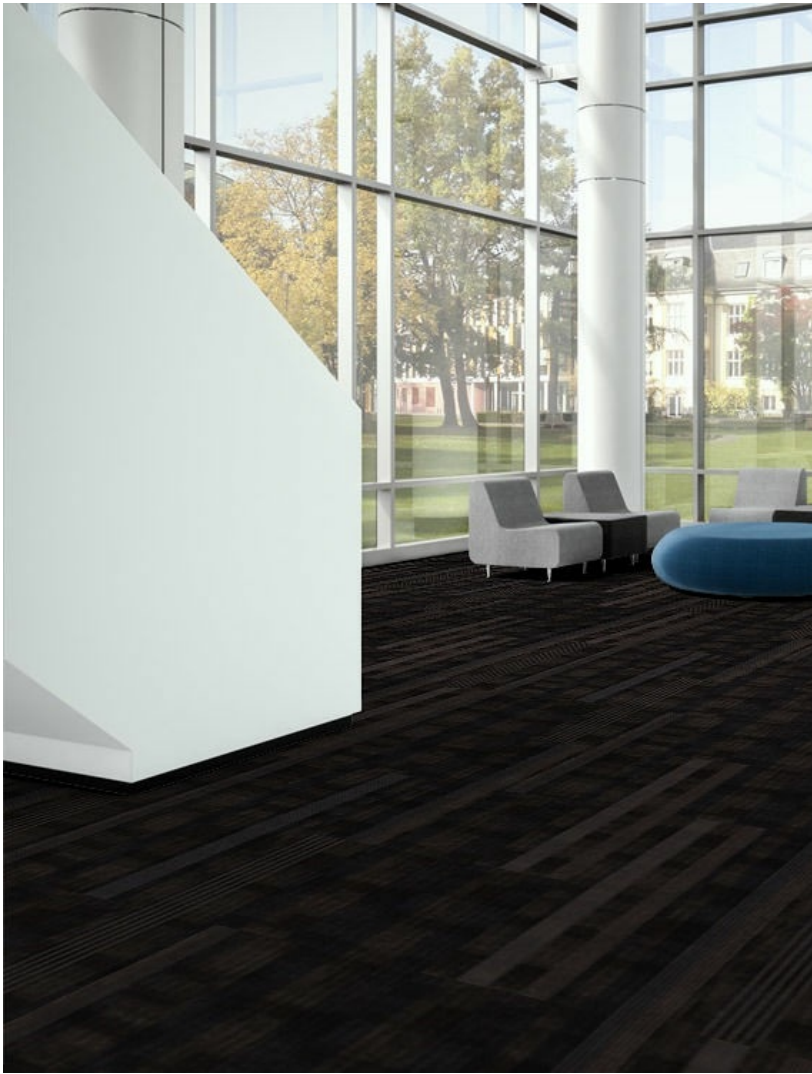
Installation Methods: Ashlar, Herringbone