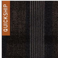
DBF59 Black Mesh