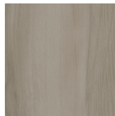
005 Sage Brush