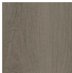
003 Scrub Oak