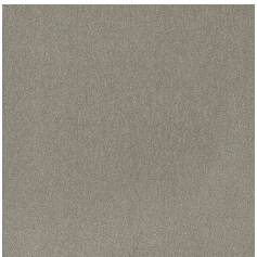
ACH74 Pearl Grey