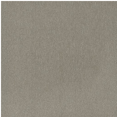
ACH74 Pearl Grey