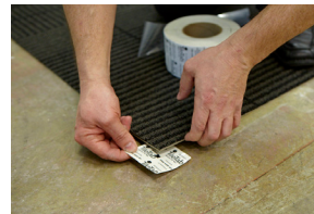
A.2 Place under the module