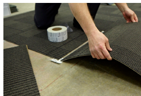
B.1 Position the next module