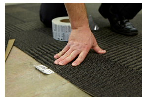
B.2 Press it into place