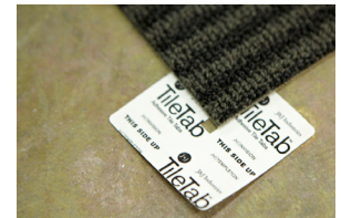
A.3 "THIS SIDE UP" facing up