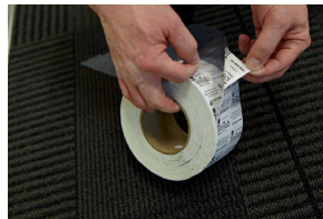
A.1 Peel the TileTab from the roll

C) Continue laying modules and TileTabs at the intersections of the module corners. Apply TileTabs at edges of modules. (See "C" diagrams.)